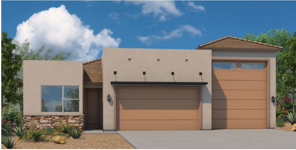
A - SOUTHWEST (Shown with Optional Stone)