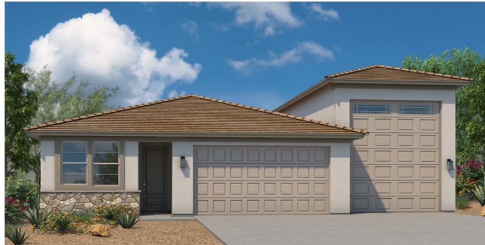
C - MODERN PRAIRIE (Shown with Optional Stone)