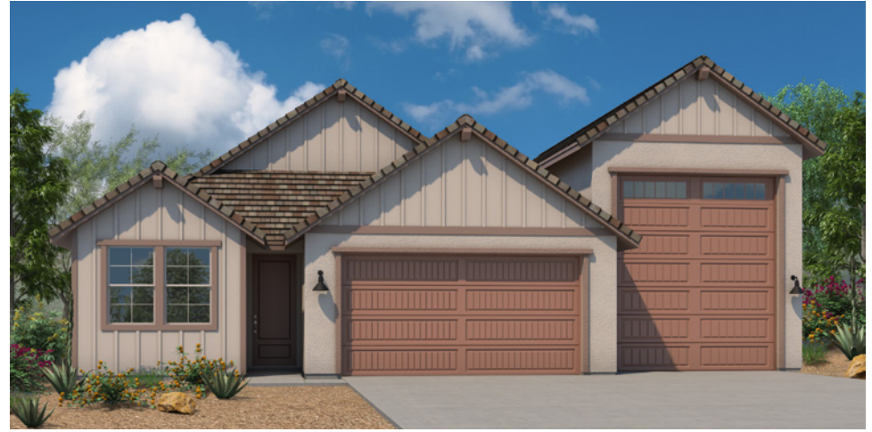
B - MODERN FARMHOUSE