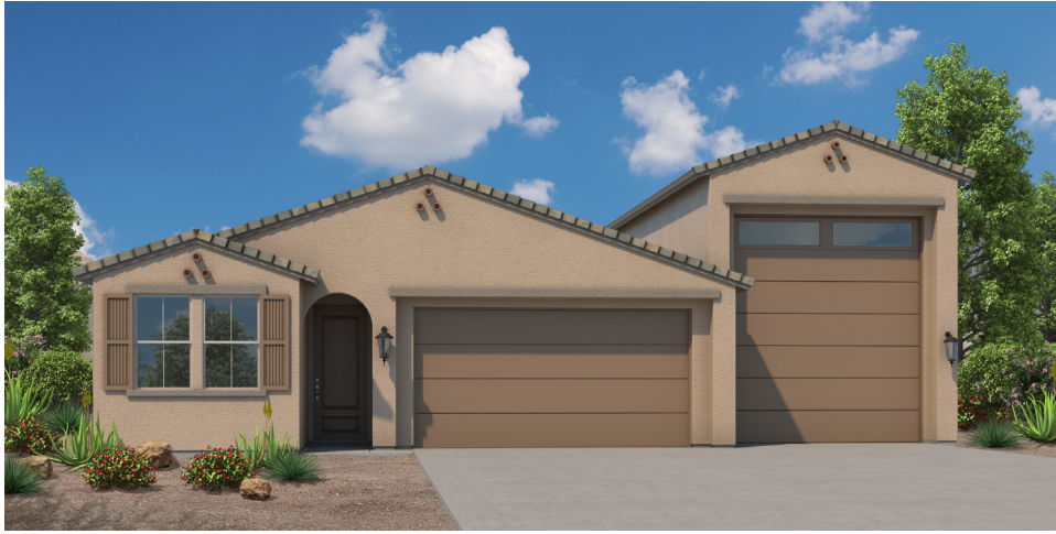
A - SOUTHWEST