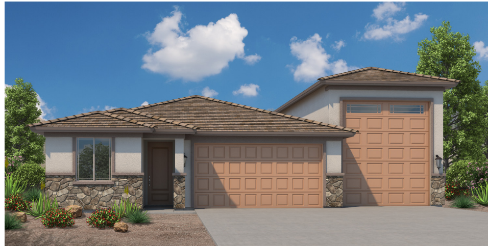
C - MODERN PRAIRIE (Shown with Optional Stone)