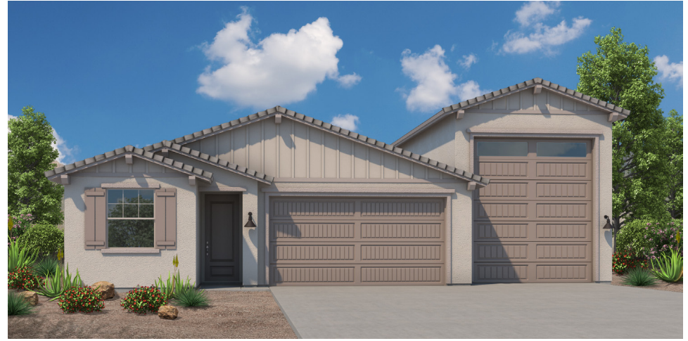
B - MODERN FARMHOUSE